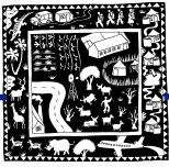
Figure 1: Communal area conservancies in Namibia